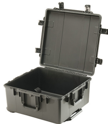
iM2875-X0000 No Foam