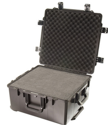
iM2875-X0001 With Foam