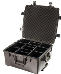
iM2875-X0002 With Padded Dividers