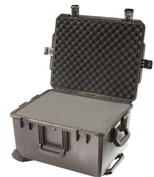
iM2750-X0001 With Foam