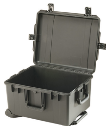
iM2750-X0000 No Foam