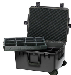
iM2750-X0002 With Padded Dividers